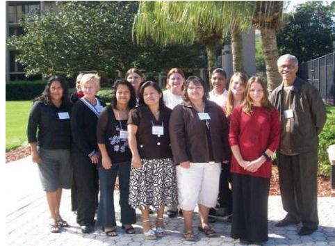
2007 Literacy Ambassadors