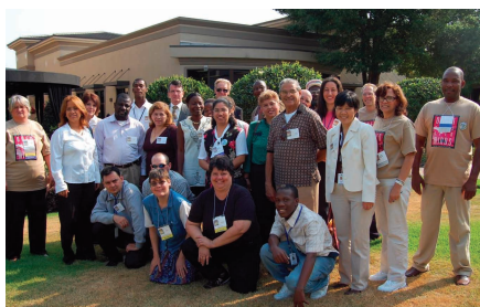
Adult Learners at the 2007 Florida Literacy Conference. (See Conference article page 4)