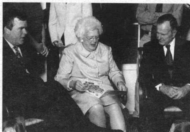
The Bush family reads together at the Celebration of Reading.